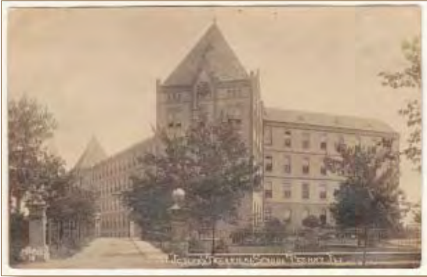
St. Joseph Technical School, Techny, Illinois.