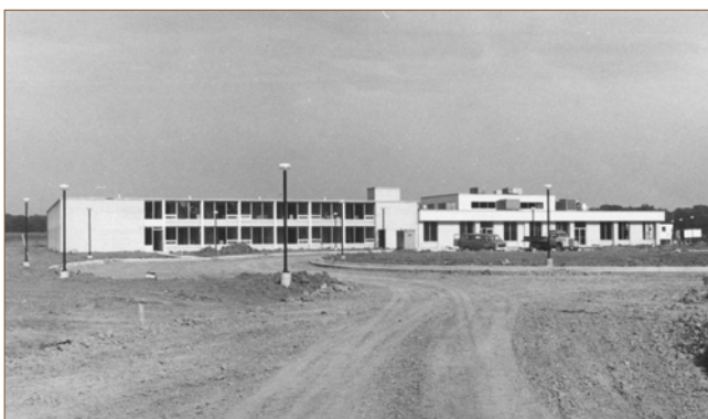
Divine Word Residence under construction.

there were few who had any regrets. The small corner tower that joined the northern wing to the main building still stands. It was one of the first parts built and served as the church for a time. Later it functioned as the post office, as it still does today, and a very busy one at that. The western wing, which was renovated very creatively, houses the entrance to the building and to the Chapel of the Holy Spirit.