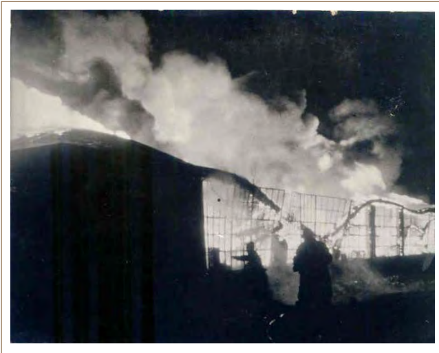
The Techny Press burned to the ground in January 1960.