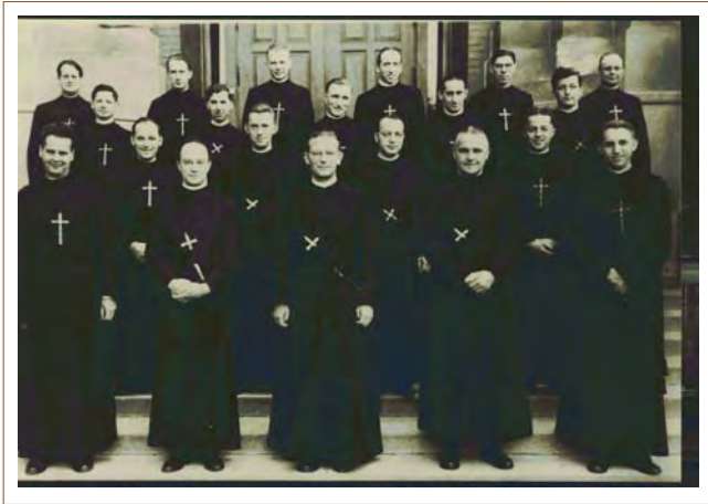
In 1944 twenty SVD missionaries received their mission crosses for Papua New Guinea.

to the missions. Often it was the Mission Office that was responsible for collecting the books and medicines and whatever else might be needed in the missions, while the seminarians sorted these materials, packed them, and sometimes, through their own moneymaking activities, financed the cost of shipping. These efforts focused the minds of the seminarians on the needs of the missions and kept the fact uppermost in their minds that they themselves might someday go to the missions.