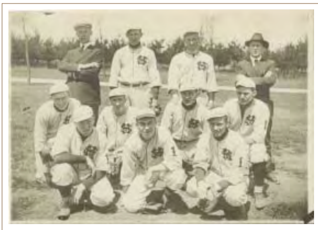
An early version of the “Techny 9.”

In this way, mission zeal was spread from Techny to the churches in and around Chicago. In this way also, the seminarians and Brothers received a genuine, useful, very effective, and continuing mission formation from the beginning of their entrance into the Society.