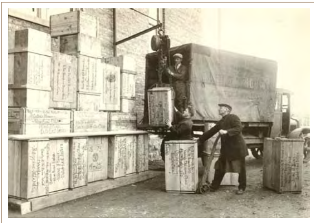
Shipping supplies to Missions.

This missionary aura at Techny was developed on various levels. One would be urged, for example, to participate in sports or other activities, because one had to be healthy to be a missionary. Hobbies and extracurricular activities were encouraged, and the time spent on these were welcome breaks from all the time spent in prayer and study. Many were somehow geared to the missions, at least in the thinking of the participants. The Mission Book Brigade collected and packed books for the missions—for the libraries of the many schools and universities the SVDs conducted in Ghana and the Philippines and elsewhere. Other seminarians sorted and packed medicines to be sent