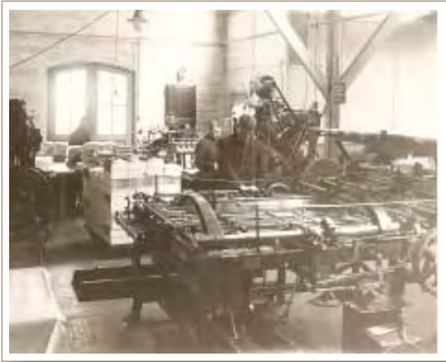
Brothers working in the press.