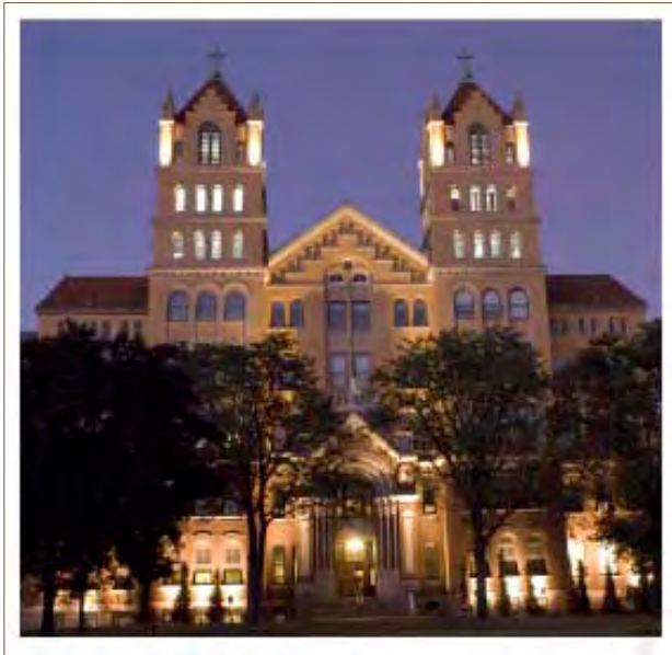
St. Mary's Mission Seminary, Techny Towers.