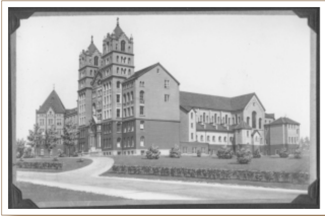
Techny around 1935.