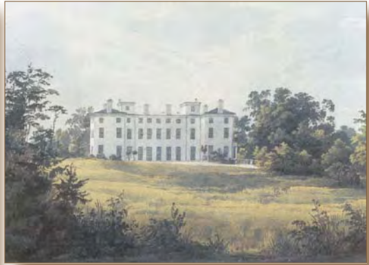
The second Bonaparte mansion.