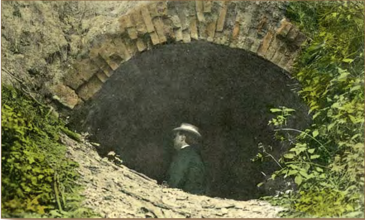
Tunnel entrance from Crosswicks Creek.

On August 18, 1942, another important guest who graced the new St. Joseph's Mission House was Dorothy Day, founder of the Catholic Worker . 25