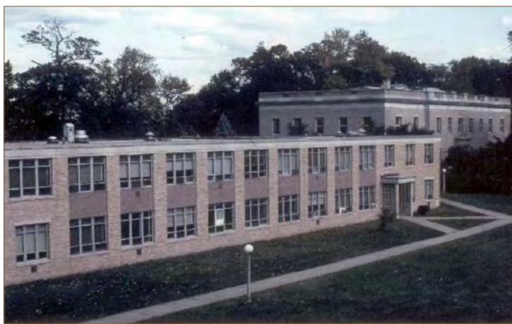
The completed school building with the mansion in the background.

gymnasium was not part of the original complex, but when it was built, it was the largest high school gym in Burlington County.