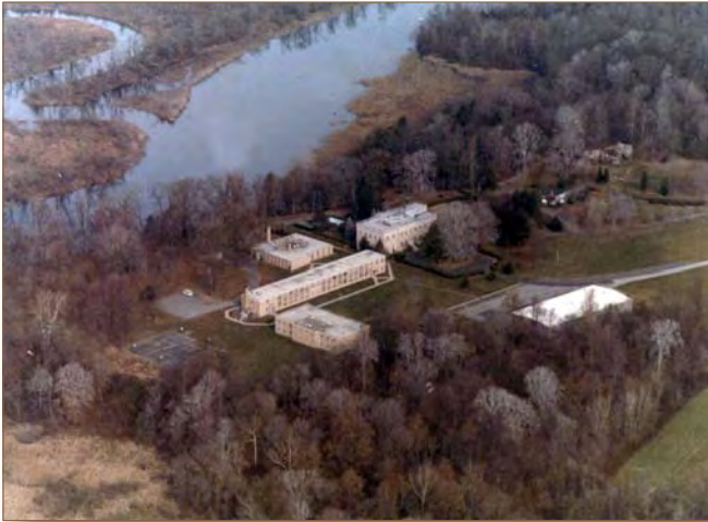
Aerial view of Divine Word Seminary in the 1970s.