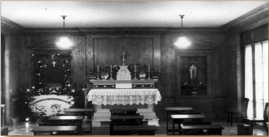
First Christmas at Bordentown, 1941.

December 9, 1941, we received the first $1 donation in the mail. Father Provincial had written an appeal letter to all former subscribers to C.F. [the Christian Family magazine] and Girard benefactors, asking them to correspond with us from now on. It was consoling to see something come in for a change, after looking at accumulating bills and other debts. 13