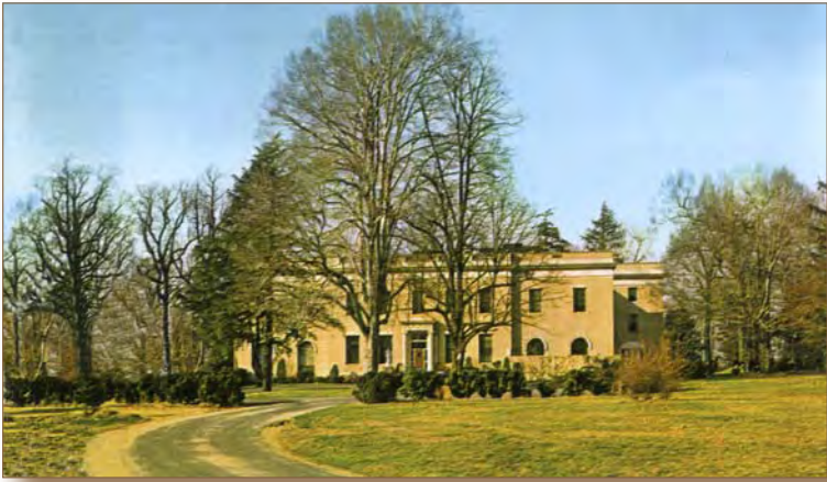
The Hammond mansion.