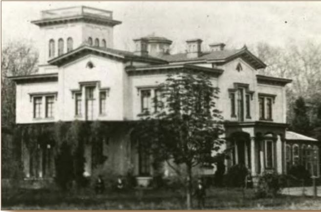
The Beckett mansion.

He hired stonemasons to build a large Chinese water garden that was to have had small boats floating in the water. The majority of the floors were built with inlaid wood or marble. The dining room, private study, and parlor were paneled with pine that had come from a castle in England. Mr. Hammond also built a secret wine cellar that was accessible from his private study through a hidden metal stairwell that led to the basement. In the wine cellar, he had many bottles of wine and liquor that evidently were purchased during Prohibition.