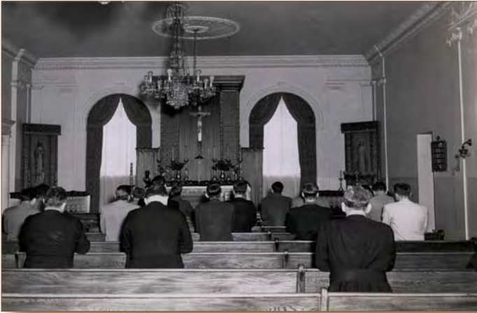
The mansion ballroom becomes a chapel.

Bordentown Seminary High School, to come and lend his talents to the students here.