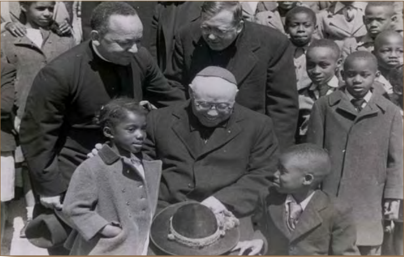
Thomas Cardinal Tien with children from Our Lady of the Divine Shepherd, Trenton, New Jersey.

I am very happy to tell you what is happening at St. Joseph's Mission House, Bordentown, New Jersey. A few years ago, the Society of the Divine Word bought the historic Bonaparte estate in Bordentown.