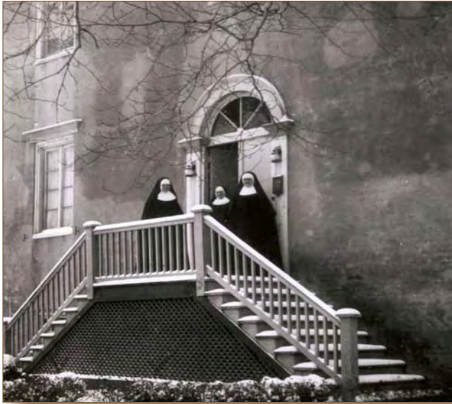
Franciscan Sisters at gate house / convent.