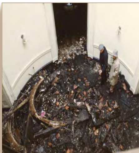
The mansion rotunda before and after the fire.