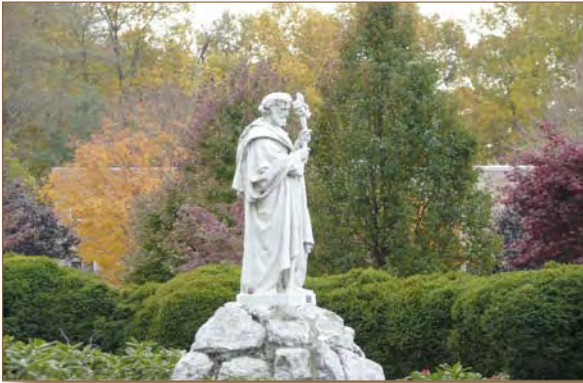
St. Joseph standing watch over the property.