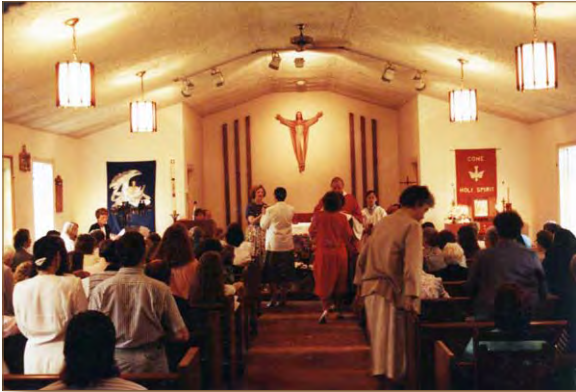
The interior of St. Anne, Webster Springs