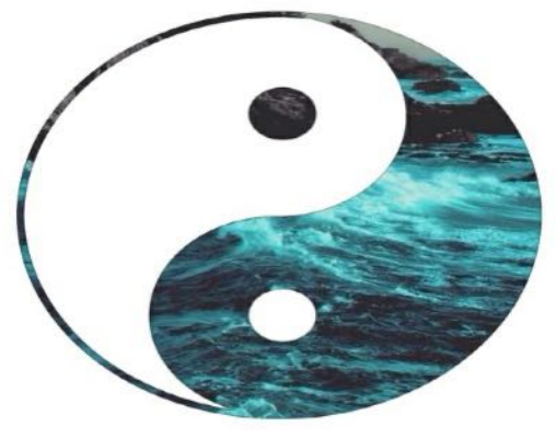
Frt. SAIMON Oscar

is flowing from the tap and messing up the room, you do not go mopping the water but close the tap". He mentioned that when having challenges in your sexuality, there is the need of seeking some guidance or therapy if need be.