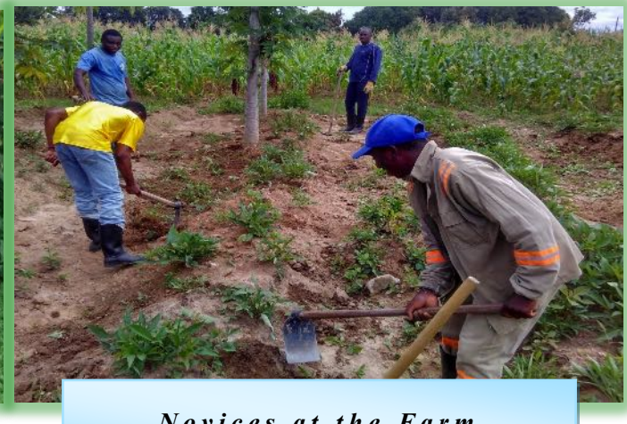
Novices at the Farm